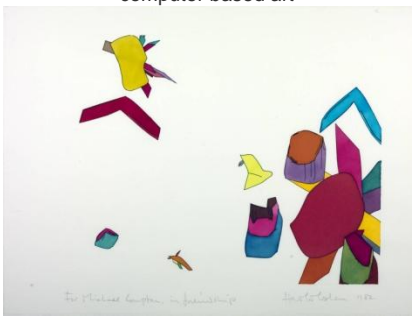
Harold Cohen Untitled Computer Drawing 1982 Tate

Generative art is art made using a predetermined system that often includes an element of chance – is usually applied to computer based art