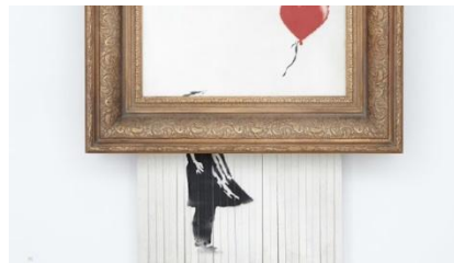
Banksy Balloon Girl Shredding (renamed) Love is in the Bin 2018

automatically shredded while people looked on in amazement. It instantly made the national news all around the world.