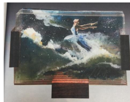
"Dancing in the Stars"