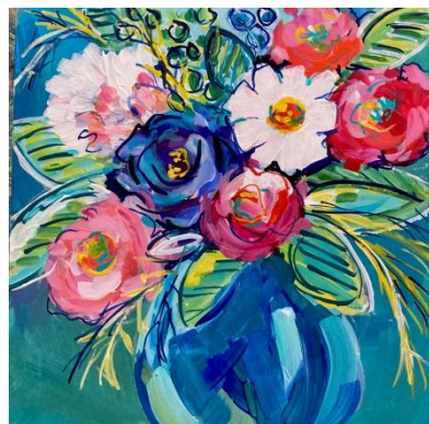
"Floral in a Blue Vase"