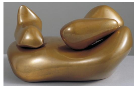
Jean Arp (Hans Arp) Sculpture to be Lost in the Forest 1932, cast c.1953–8 Tate

superb biomorphs at that time, and later so did Louise Bourgeois .