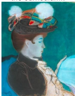
Louis Anquetin Girl Reading a Newspaper 1890

ÉCOLE DES BEAUX-ARTS École des Beaux-Arts is a French term meaning school of fine arts. The basis of the teaching was the art of ancient Greece and Rome, that is, classical art . But anatomy, geometry, perspective and study from the nude were also part of the curriculum..